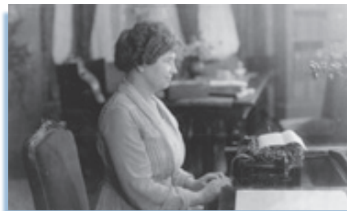
Helen Keller's work, Wie ich Sozialisten wurde (How I Became a Socialist) was banned by the Nazi regime.

From April 20 through June 17, the Wyandotte County Historical Museum, 631 North 126th, Bonner Springs, Kansas, will host the United States Holocaust Memorial Museum's traveling exhibition Fighting the Fires of Hate: America and the Nazi Book Burnings . Using documents, film, video and newsreel footage, the exhibition provides a vivid look at the first steps the Nazis took to suppress freedom of expression and the strong response that occurred in the United States